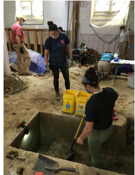
Excavations at The Basilica of St. Mary of the Immaculate Conception led by Data Investigations, LLC.

You might think that with the recent quarantine that the pace of work at DHR has slowed. This is not the case. Just in the last three weeks I have watched crypt excavations (and carried not a few buckets of dirt) at the Basilica of St. Mary in Norfolk where the congregation is committed to having DNA research conducted so they can identify living family members of those people being moved, worked with our conservation staff to help a museum in Richmond that was recently damaged by fire to establish protocols to recover burned and soggy archival materials, identified inadvertently discovered human remains in an 18 th century deposit, coordinated the