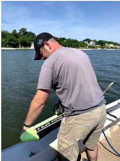
JRS May 2019 survey, diver lowers sonar towfish into the water.