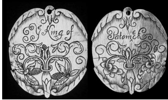
"Ye King of Patomeck" medal found in 1832 to the people at Camden site, Virginia.

Virginia Historical Society recovered the right medal from the Camden property in 1832. Howard MacCord's excavation in 1969 recovered the other one. This was the first archaeological excavation that your author worked on. It was recovered one square over from me. Both medals are now on display at the Virginia Historical Society's museum.