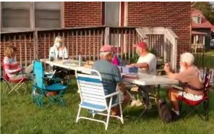
Chapter members working on artifacts during the COVID 19 era.