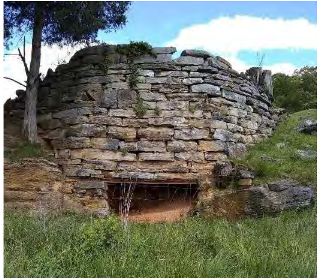
Lime kiln, Reeves Road, Augusta County.