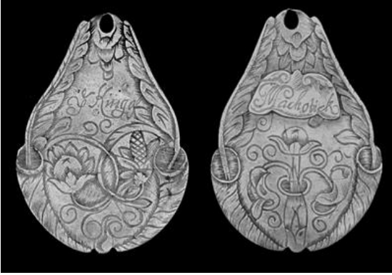
"Ye King of Mahotick" medal recovered during MacCord/Carter 1969 excavations.