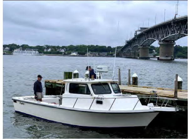
JRS May 2019 survey, survey boat.