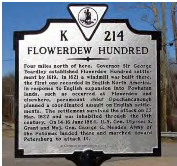
State Historic Marker for Flowerdew Hundred.

As we stood on the edge of James at eight o'clock in the morning watching the squadron of eagles fly by for our entertainment, we thought, while not good, things could be much worse. The return to Flowerdew after all these years was bittersweet. Things were familiar but a little out of whack. The road system had changed and, unfortunately ran along the river's edge where many of the significant sites were located. The 1620ish stonehouse foundation remained buried but was overgrown. Some brick features on an 18 th -century site downriver remained exposed. The missing factor was the total lack of stewardship of the archaeological resources. There was no recognition of the fact that this place was one of the most significant sites in Virginia and perhaps the nation. As Flowerdew Hundred is up for sale, we can only hope the next owner will be more enlightened as to the importance of the past. For just $12.2 million, you can be that person. ☀