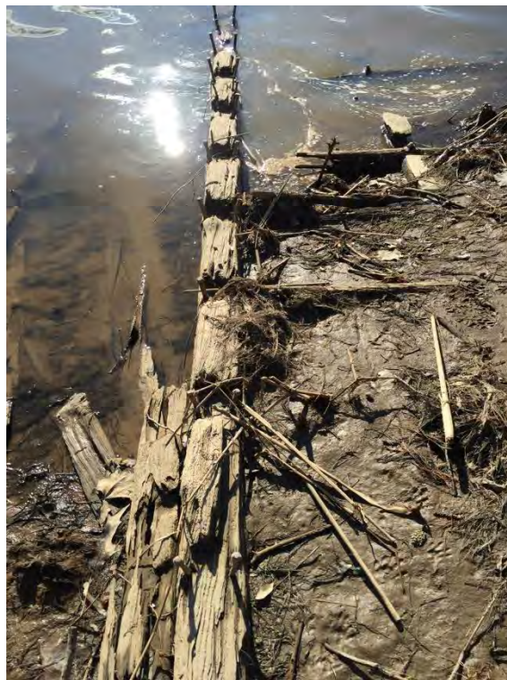
Wharf or Vessel? This structure is exposed in Kittiewan Creek at low tide.

But if your “artifact” is an entire 700-acre property populated with a historic manor house and countless collections of diverse artifacts, the winter’s “catch-up” is likely to entail a combination of planning for the year ahead and a far different set of tasks. This winter, ASV’s Kittiewan volunteers have made headway on a wide variety of chores—from planting 250 daffodils and peonies around the Manor House (check us out this spring!), to replacing the aging wiring in the barn, to erecting a new sign out on Route 5, to trying to impose some order on the framed artwork, textiles, tools, and archival notebooks (so well curated by Kathleen Baker and the late Cindy Dauses) that comprise the Cropper collections.